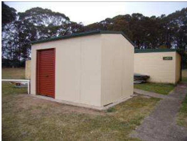
The new Storage Shed

New weatherboards have been purchased for the hall and after they have been painted volunteers will be needed to help with replacing old boards on the two ends and the back of the hall. This is being funded by the Country Halls Renewal Grant.